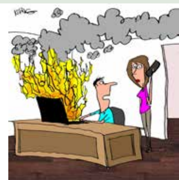
“Cancel that call to tech-support. This may be beyond their capabilities.”